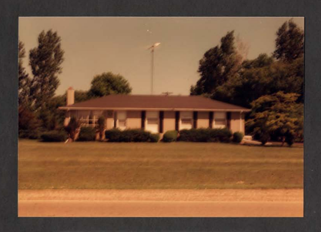
LOT 44 NORTH TALBOT ROAD EAST