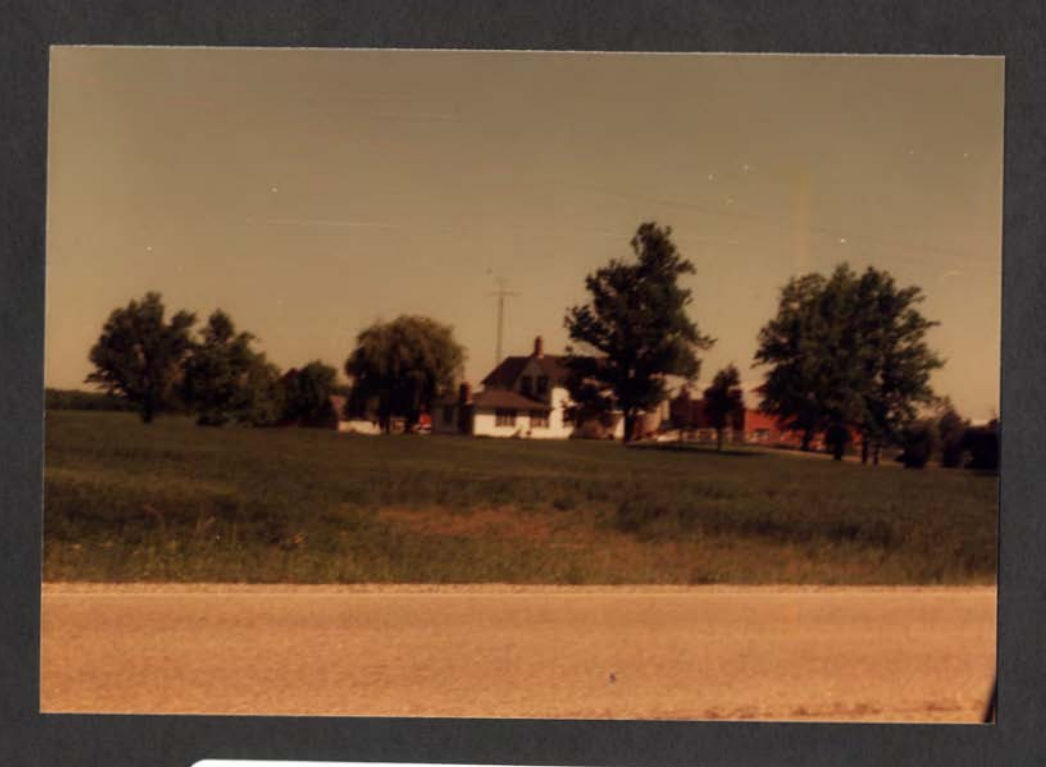
LOT 40 NORTH TALBOT ROAD EAST William Vanderwyst