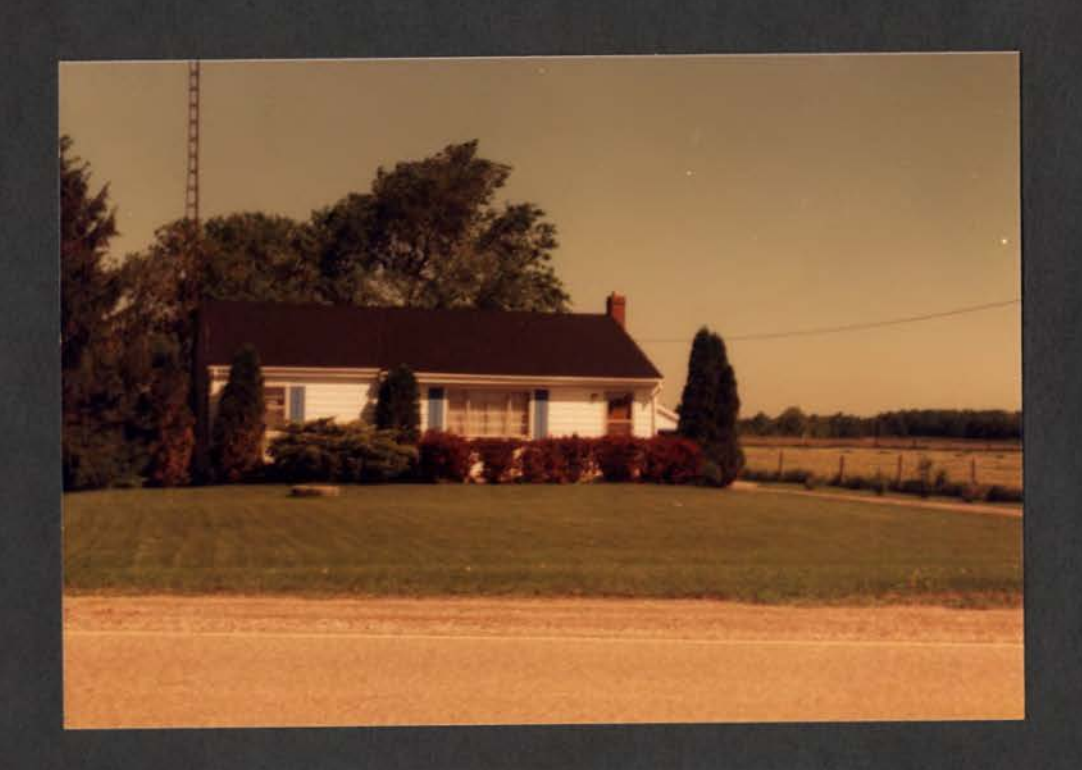
LOT 41 NORTH TALBOT ROAD EAST