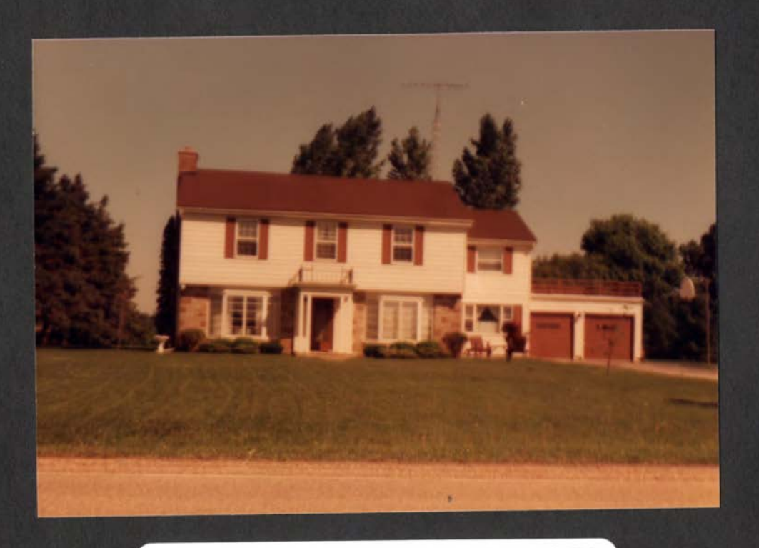
LOT 43 NORTH TALBOT ROAD EAST Bud Westaway