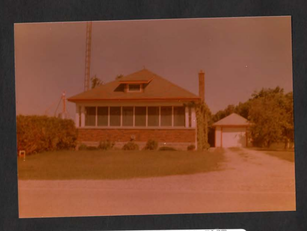
LOT 39 NORTH TALBOT ROAD EAST Kenneth Butler