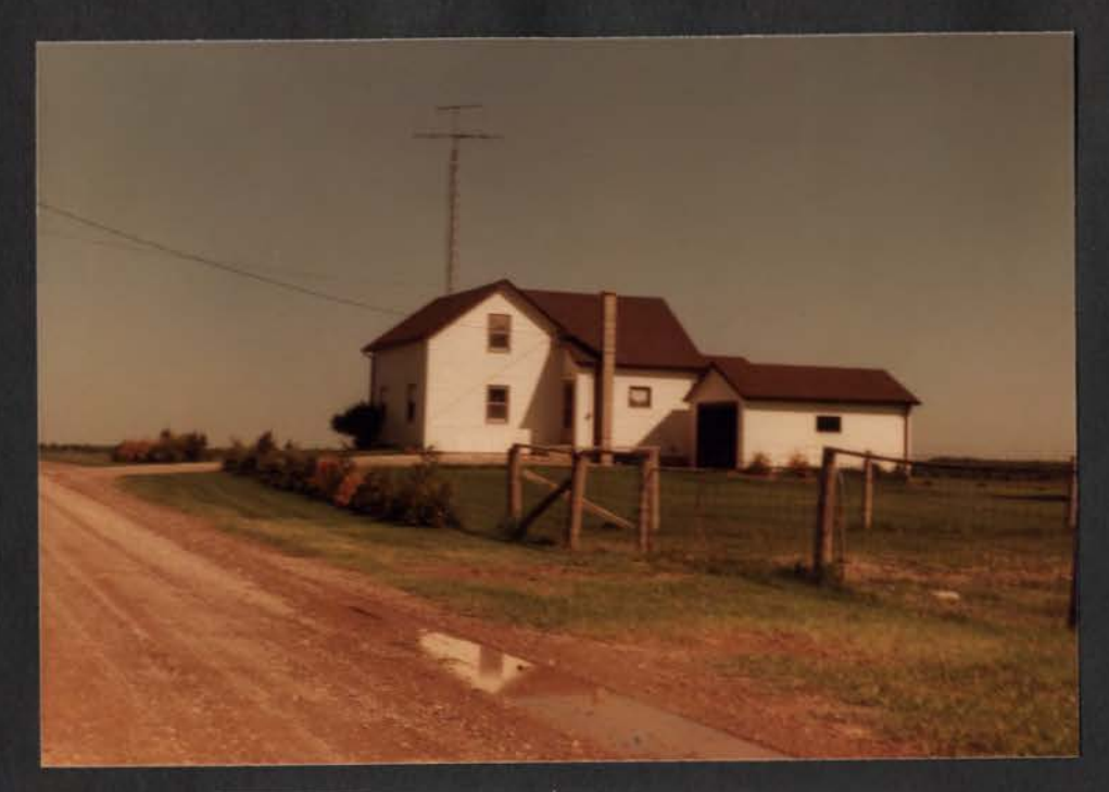
LOT 39 NORTH TALBOT ROAD EAST