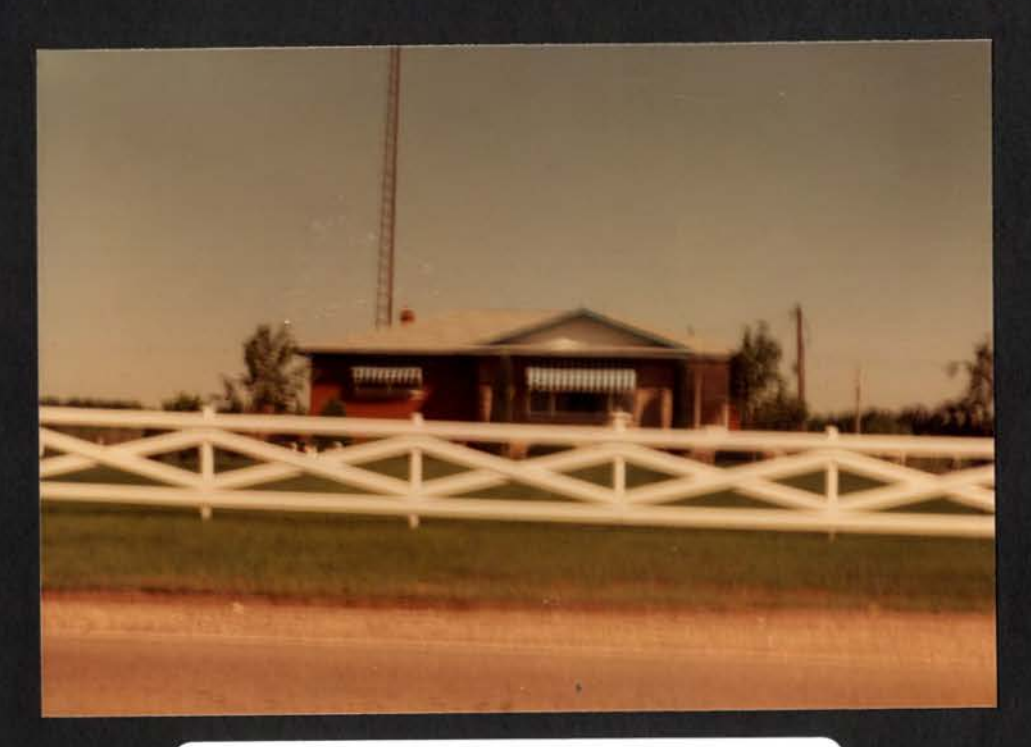
LOT 44 NORTH TALBOT ROAD EAST Mrs. Ryk Snetselaar