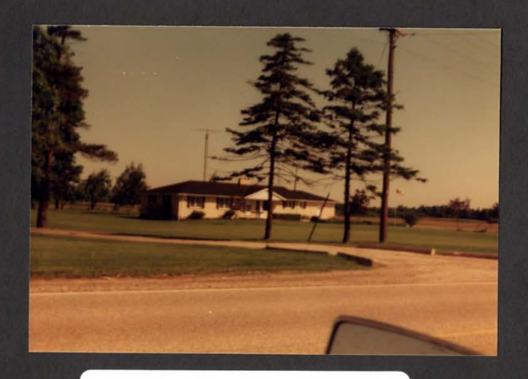
LOT 41 NORTH TALBOT ROAD EAST Robert Lyle