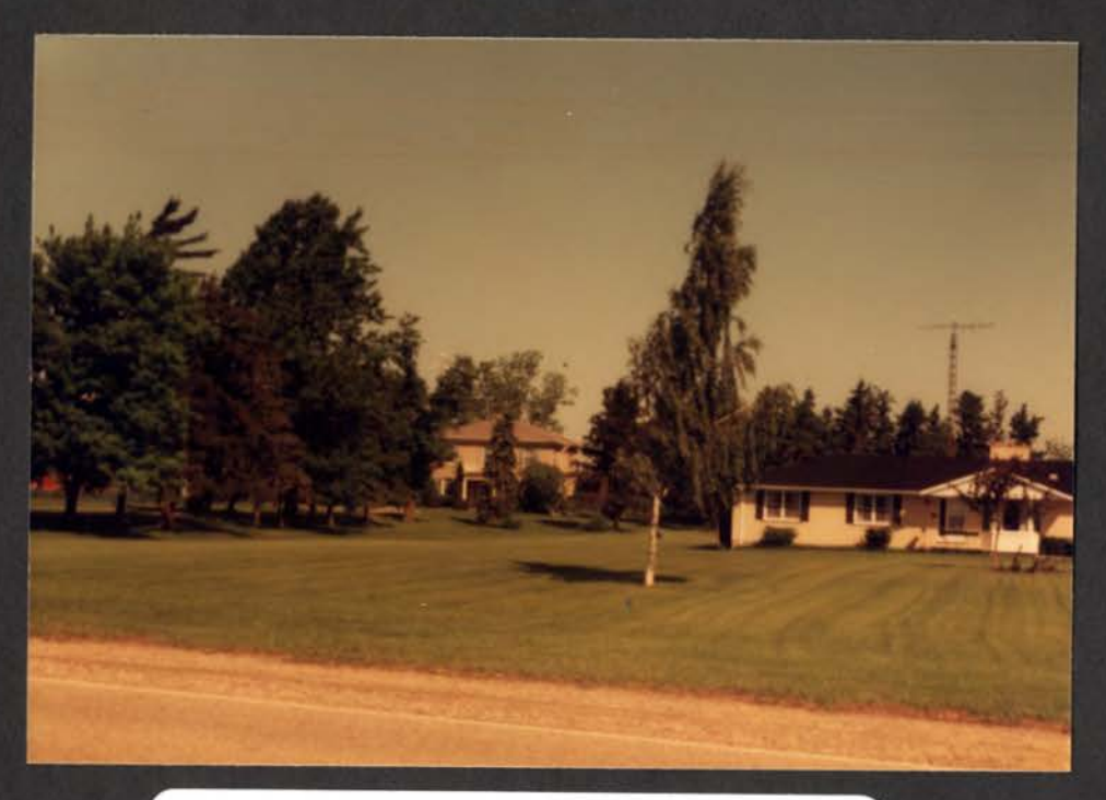
LOT 41 NORTH TALBOT ROAD EAST J. & J. Lyle